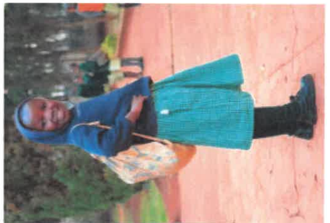
International Choose Kind Libraries Tumaini Children's Home, Kenya - 2018