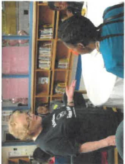
Richardson ISD Choose Kind Libraries Forestridge - 2018