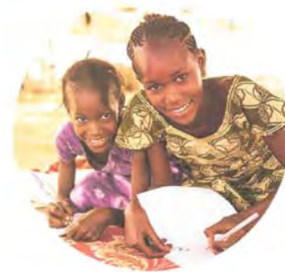
SEND A GIRL TO SCHOOL

donation of $275 will allow a girl to attend school for an entire year. It is no secret that in poor economic countries, girls often suffer from gender discrimination. They are denied the opportunities to go to school because of the limited resources of their families.