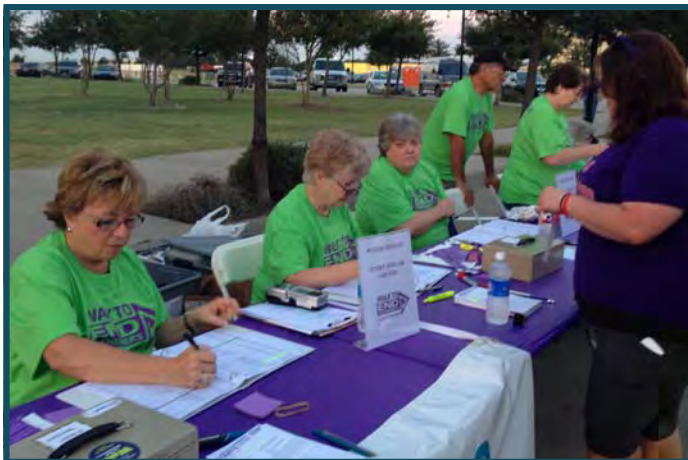
Below: Our crew at work, registering the walkers.