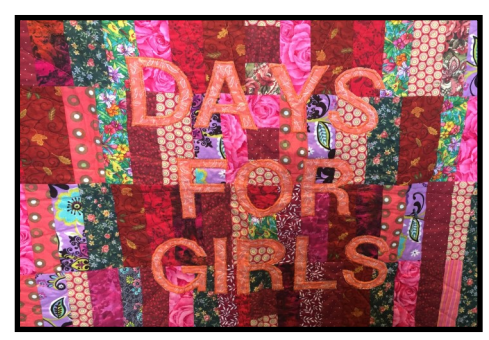
The colorful Days for Girls quilt was

The Highland Village DFW Metroplex Days for Girls Chapter annually takes reusable feminine hygiene kits to Africa in July. This year they had 1,000 0 prepared kits but then received notification of an urgent need to provide additional kits for over a million women and girls from South Sudan living in refugee camps. Because of time restraints, the only option for providing more kits was to divide the already prepared kits in half to help an on display at the event, too.