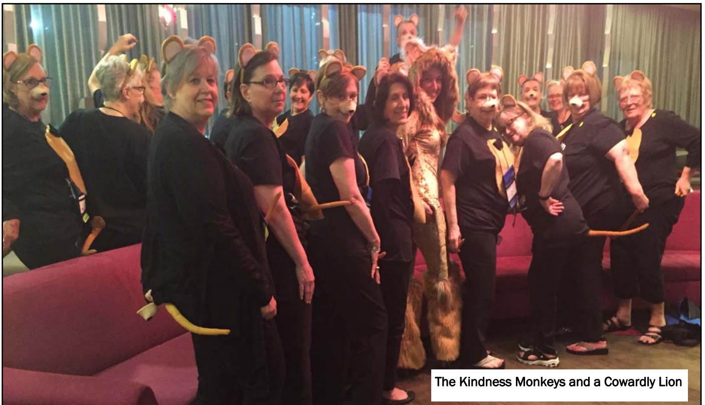
The Kindness Monkeys and a Cowardly Lion