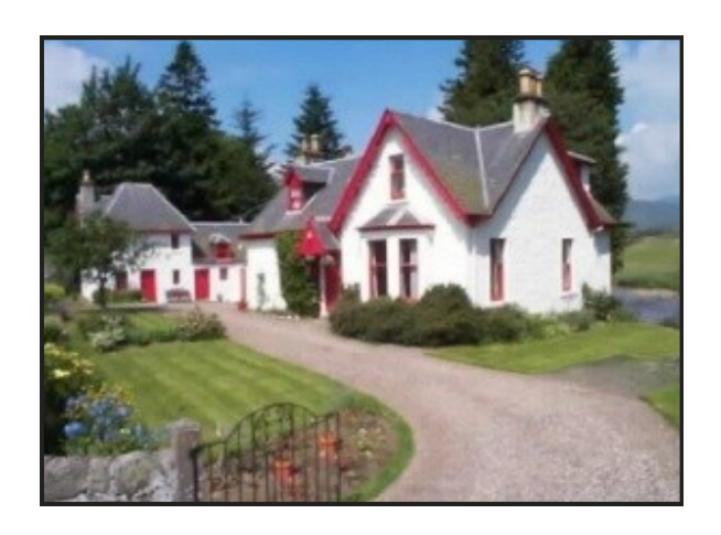
Corrydon Lodge Perthshire, Scotland