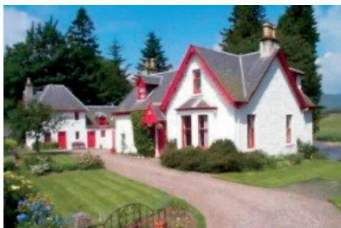
Corrydon Lodge – Perthshire, Scotland