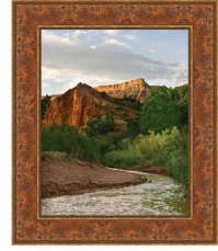
VACATIONS GRAND CHILDREN