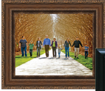
WEDDINGS FAMILY PORTRAITS BELOVED PETS

YOUR FAVORITE PHOTO PRINTED ON CANVAS ENHANCED WITH QUALITY CUSTOM FRAMING